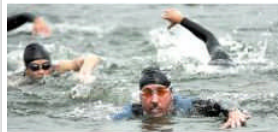
More than 500 competitors took part in the annual Over the Mountain Triathlon beginning with the swimi across Moss Lake Saturday morning.

Print Story | E-Mail Story | Font Size A A A